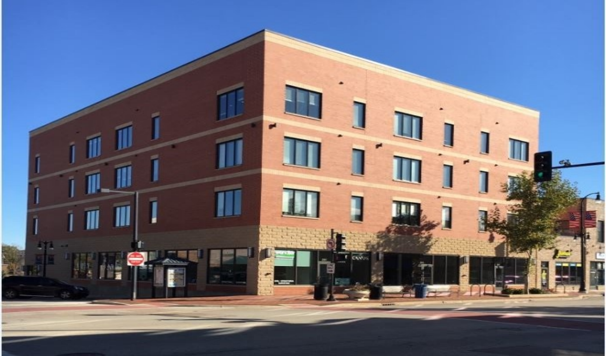
Agora Tower—Fourth and Locust Streets (Occupancy in June, 2022)